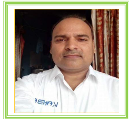
Message from the Desk of Dean

KANBA School of Management & Technology is a KRC of Maulana Mazrul Hauque Arabic & Persian University , Patna. It was founded by MBA professionals to promote vocational education in rural areas. KANBA is known for its trust and commitment towards the upliftment of the society. We regularly evolve new ways for the development of youth seeking growth of their career. We have ventured into sports and started KANBA Sports Academy to promote cricket in Barh. Hope we will be able to fulfil the expectations of citizens of Barh.